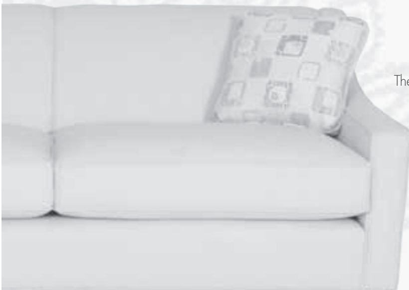
716-70 standard sofa

The expertly tailored Blake, with a tight back and loose, welted seat cushions, boasts gently sweeping, low track arms. Tapered square legs add contemporary appeal.