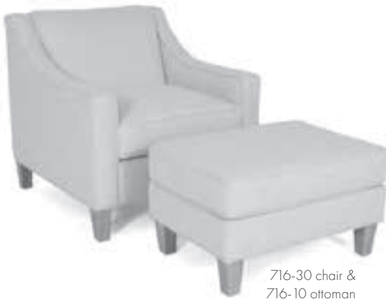
716-30 chair & 716-10 ottoman